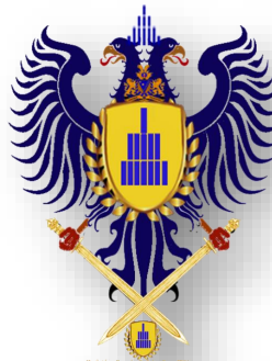
HOUSE OF SHEBA AKF-FOS